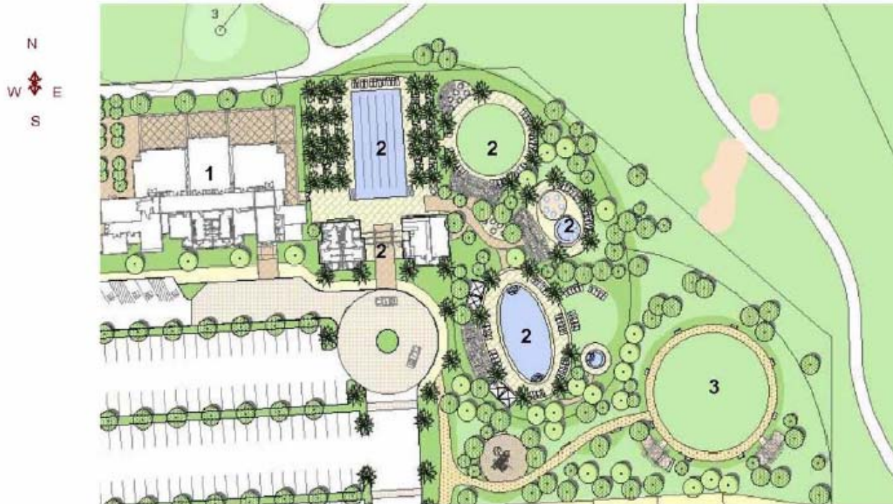
Figure B - Community & Aquatic Center Site Plan*