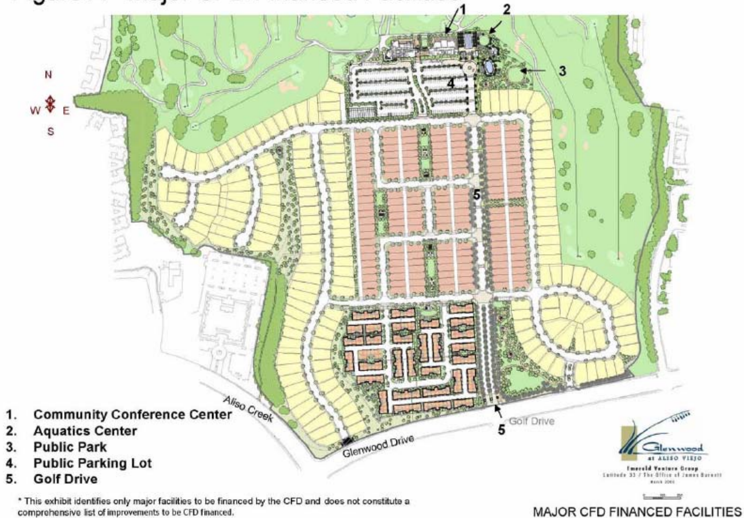
Figure A - Major CFD Financed Facilities*